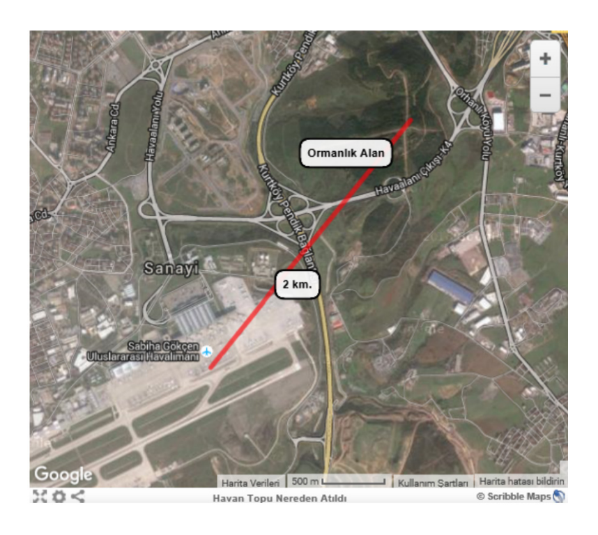
The mortar fire-positions in the Sabiha Gokcen Airport Terrorist Attack: http://www.hurriyet.com.tr/aa-sabiha- gokcen-havalimanindaki- patlamanin-nedeni- havan-mermisi- 40037256, Accessed on: May 23, 2016.

Notably, had the terrorists infiltrated to the mortar fire-positions with a third-generation MANPADS instead, then results might have been catastrophic. The minimum engagement range for an SA-18 is 0.5km for approaching and 0.8km for receding targets respectively.<sup>20</sup> Aircrafts are most fragile during landing and take-off due to low altitude/speed, thereby, they constitute 'lucrative and sensational' targets for terrorist use of MANPADS.